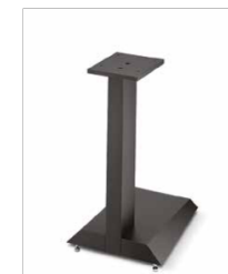
THEVA N°1 STAND