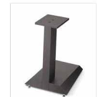
THEVA CENTER STAND