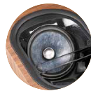
Dolby Xmos® effects