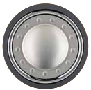
Almg TNF tweeter