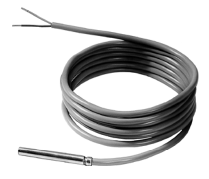
QAZ21.. and QAZ36..