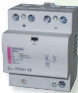
ETITEC B-PV 550/12,5 (10/350)