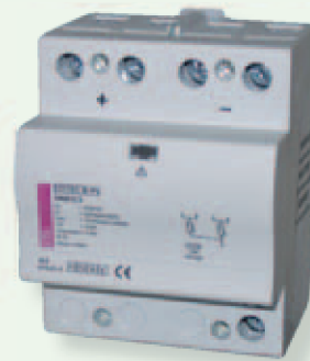
ETITEC B-PV 1000/12,5 (10/350)