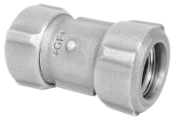
Coupling, short, galvanised equal, for ISO 65 Steel pipe