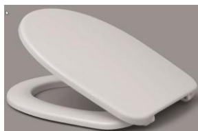
universal round edges