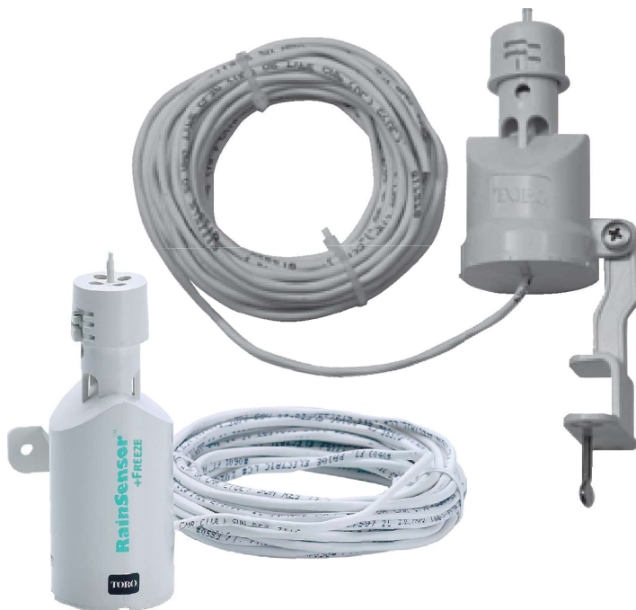
Wired Rain/Freeze Sensor

Includes 25 feet of white outdoor-rated, UV-resistant cable.