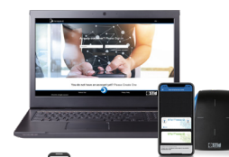
STid Mobile ID® Online Portal Web platform for remote management of your virtual cards

*Our readers only read the / UID PICO1444-3B serial number of the iCLASS™ chip. They do not read the cryptographic protections iCLASS™ nor the / UID PICO 15693 serial number of HID Global.