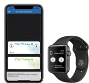
NFC and Bluetooth® Smartphones / connected watches with STid Mobile ID® application