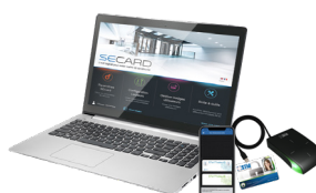
SECard SECard configuration kit and SSCP® v1 & v2 and OSDPT™ v1 & v2 protocols