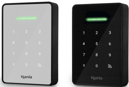
KS12100031.302 - ergo-X black KS12100031.303 - ergo-X grey