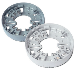
Separate bases - detail

nebula detector can be directly wired to lares 4.0 control panel, custom balances. The real time status of the smoke detector is shown on the APP lares 4.0 user, page Security -> Sensors -> Smoke category.