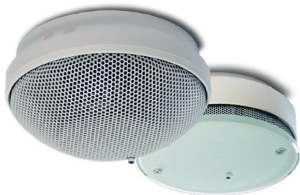
KSF5100001.001 - glass design KSIF5100001.003 - mesh design

nebula detectors are optical devices that allow smoke and fire detection in compliance with Eu law DIN EN 54-7.