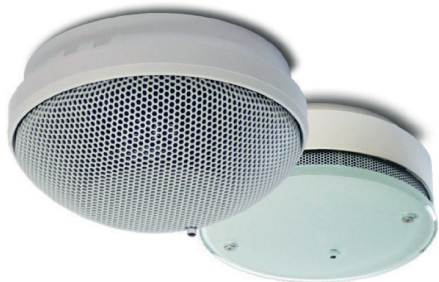
KSF5300001.001 - glass design KSF5300001.003 - mesh design

Adding a nebula in the system consists in configuring a new "zone", the real time status of the smoke detector is shown on the APP lares 4.0 user, page Security -> Sensors -> Smoke category.