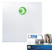
GAT nano - UHF middle range compact reader for driver identification