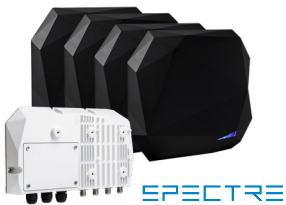
SLA - Scalable long range reader - up to 4 antennas