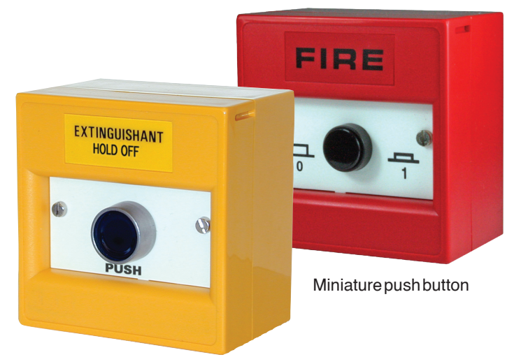
Shrouded push button