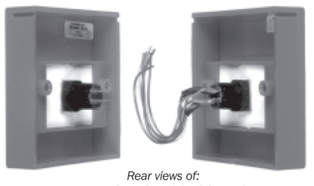
Rear views of: a terminated model - right and a non-terminated model - left.